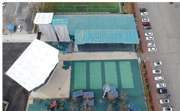
亚洲锦标赛(ACH) 2024 中国 泰安 赛事场地平面布置图 Asian Championships (ACH)2024 site layout, Taian, China