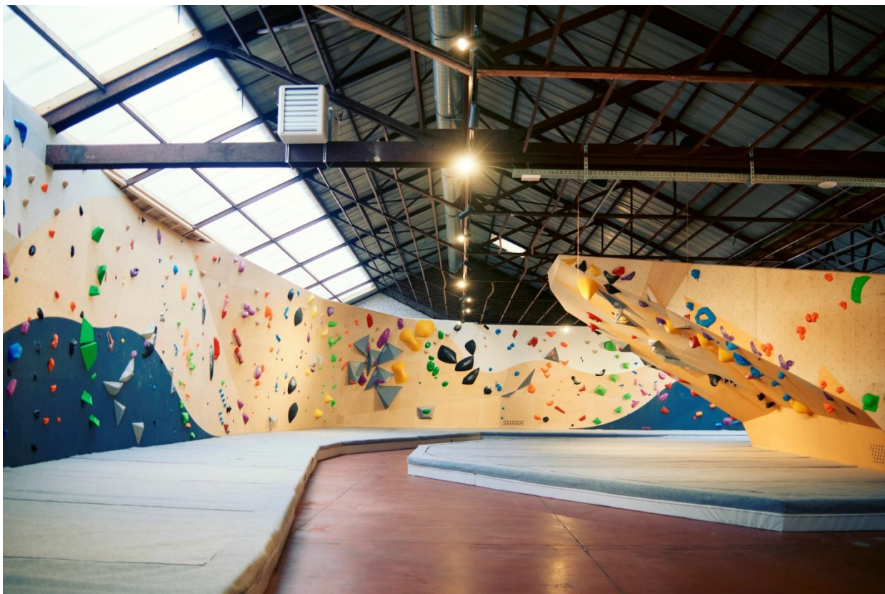
Warm up and Isolation zone