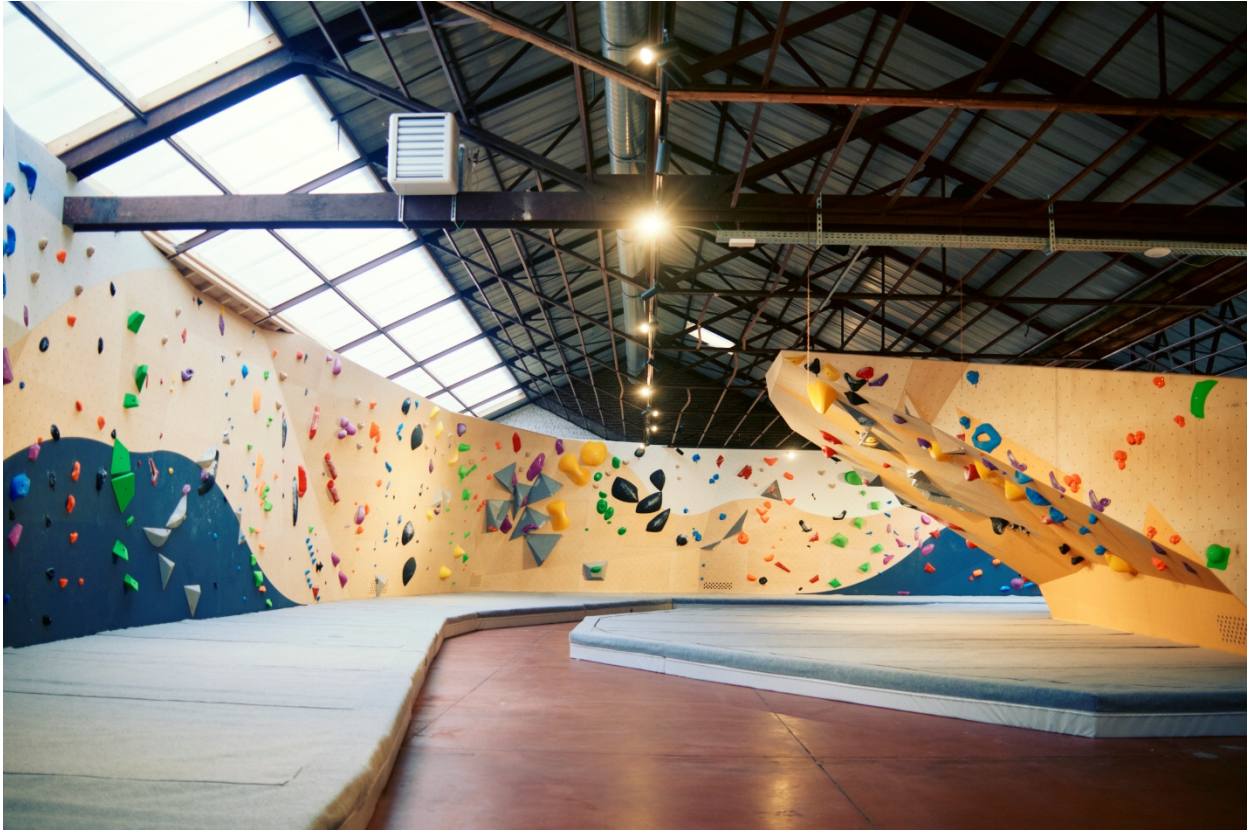
Warm up and Isolation zone

The competition will be held on an outside wall, the new Titan from Entre-Prise.