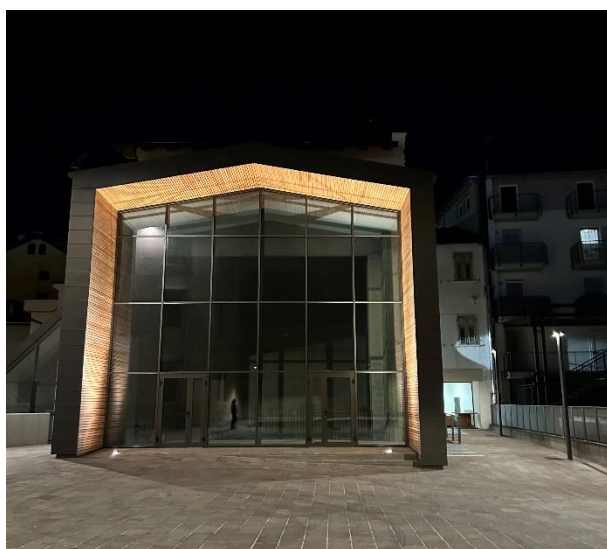
Event Organiser's Sponsors