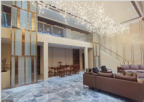
酒店大堂 Hotel Lobby